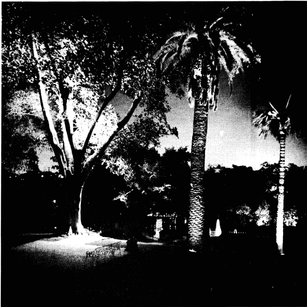
Night lighting creates this enchanting view of AMBASSADOR COLLEGE campus