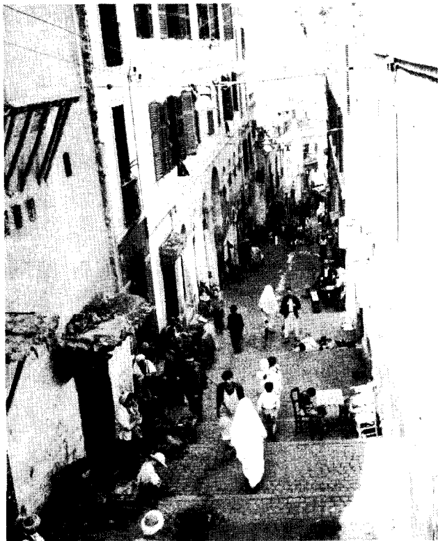
Left: A main street in typical middle-eastern cities. From such a street usually run torturous alleys and narrow pathways. Note the salesmen lining the street with their wares.