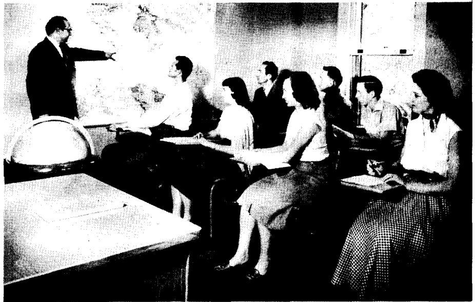
An Ambassador College class in session—reflecting the excellent faculty-student ratio which facilitates personalized instruction.

But there is one college which is awake to the evils of this world's education. It has set out to correct these errors by imparting the knowledge of the purposes of human existence—by objec-