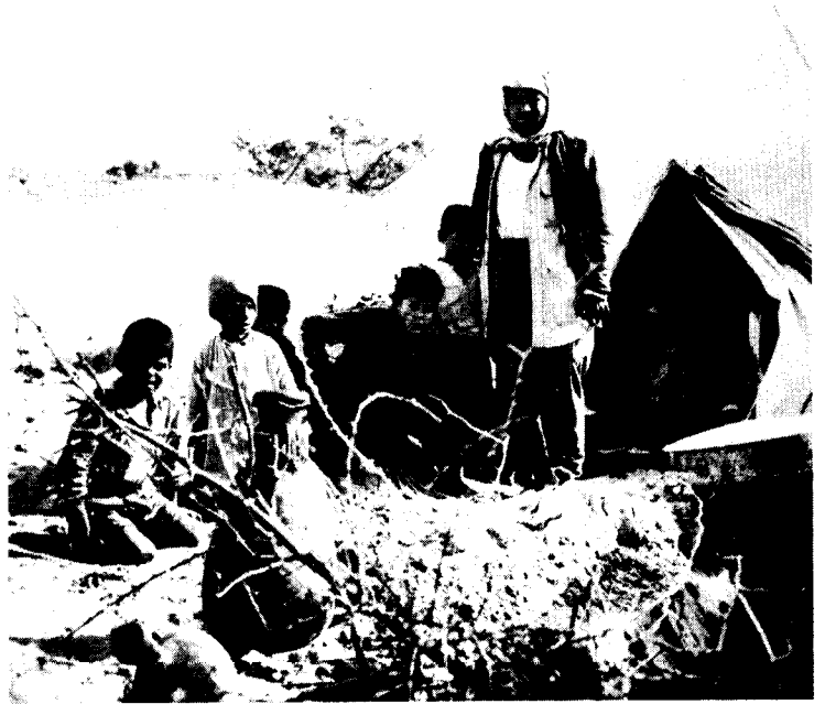
Above: Here you see the degenerate conditions under which many Arab refugees from Palestine must live. What a contrast to the mighty people who once inhabited this region!